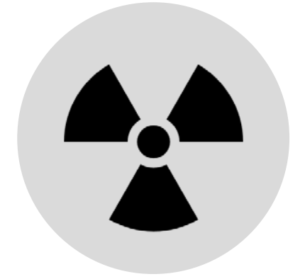
Clean up contamination that could impact our health