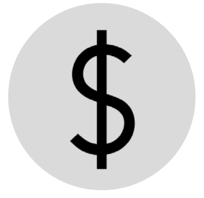
Create hundreds of thousands of jobs and billions in tax revenues

Over the next 20 years, thousands of underutilized properties across America will be re-purposed in an intentional manner to increase environmental, physical, and economic well-being and reduce inequities.